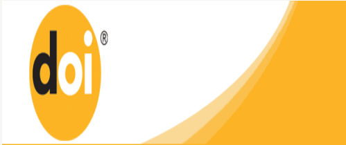
Digital Object Identifier System (doi.org)